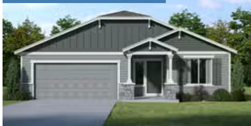
V - Farmhouse, 2 Car