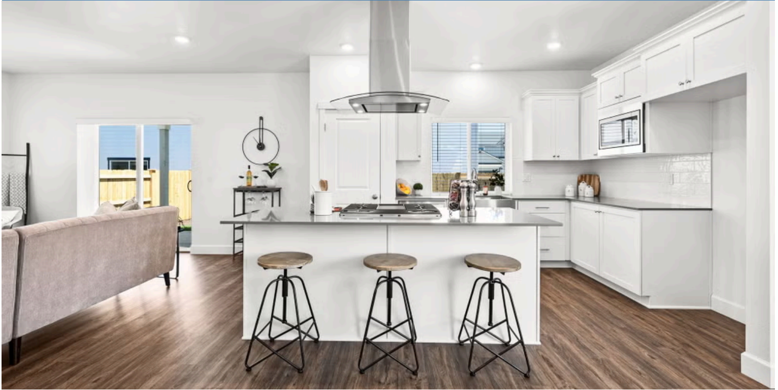
X - Craftsman