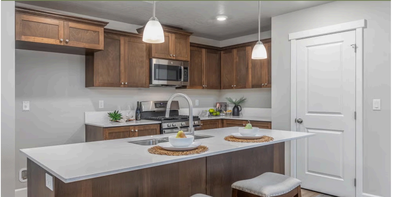
T - TRADITIONAL 2 CAR