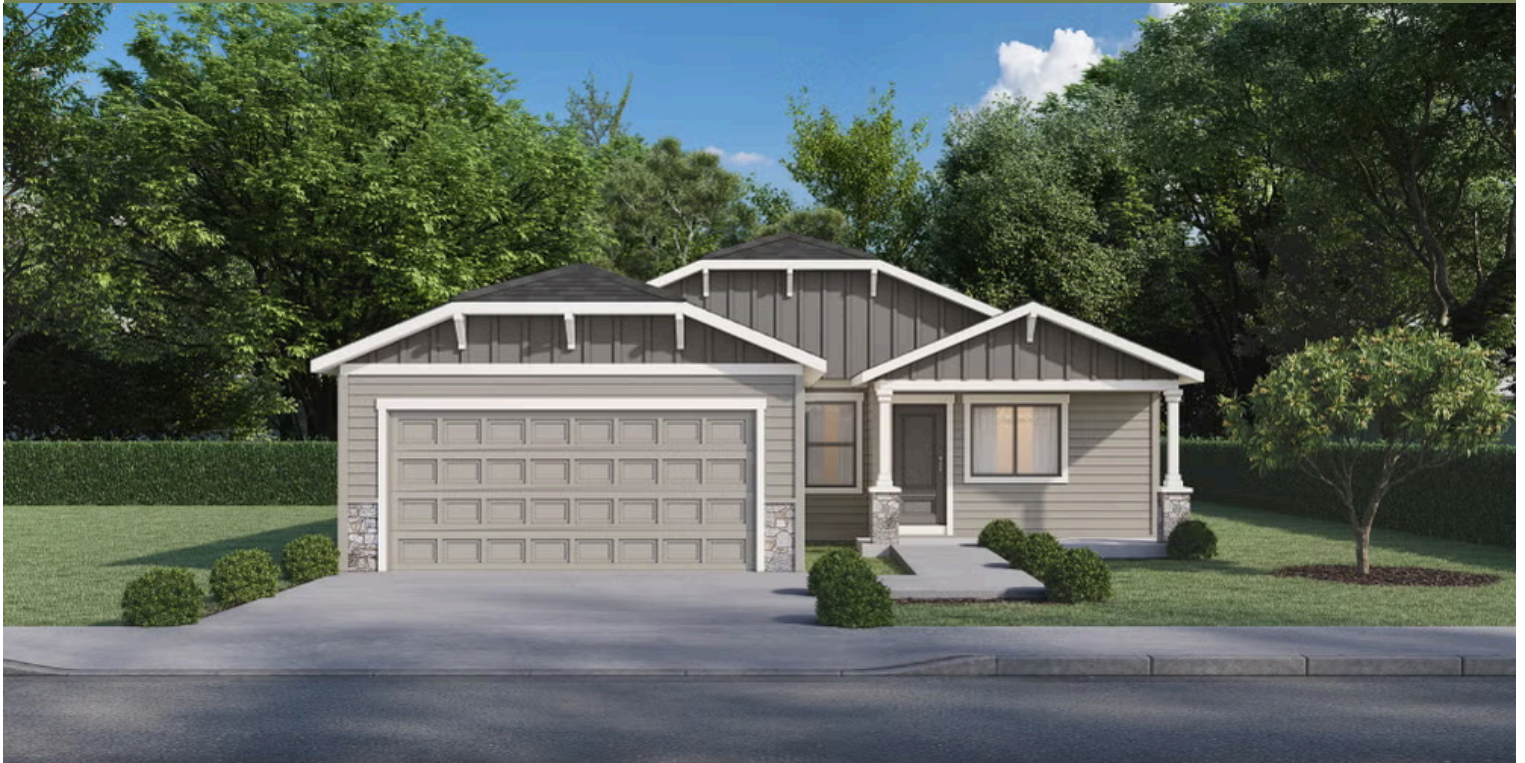
U - CRAFTSMAN