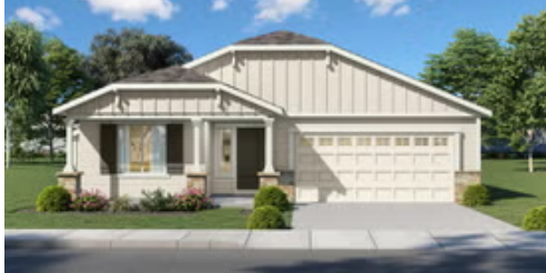
V - Farmhouse