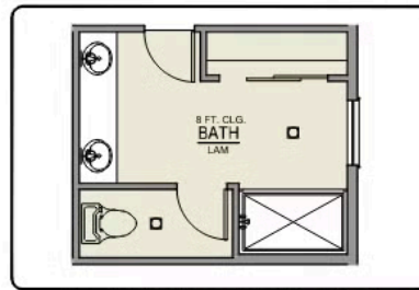
PRIMARY BATH LINEN CLOSET OPTION