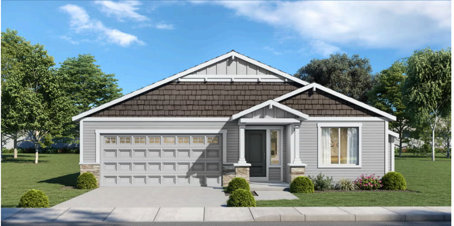
T - Traditional