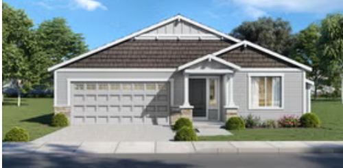
U - Craftsman