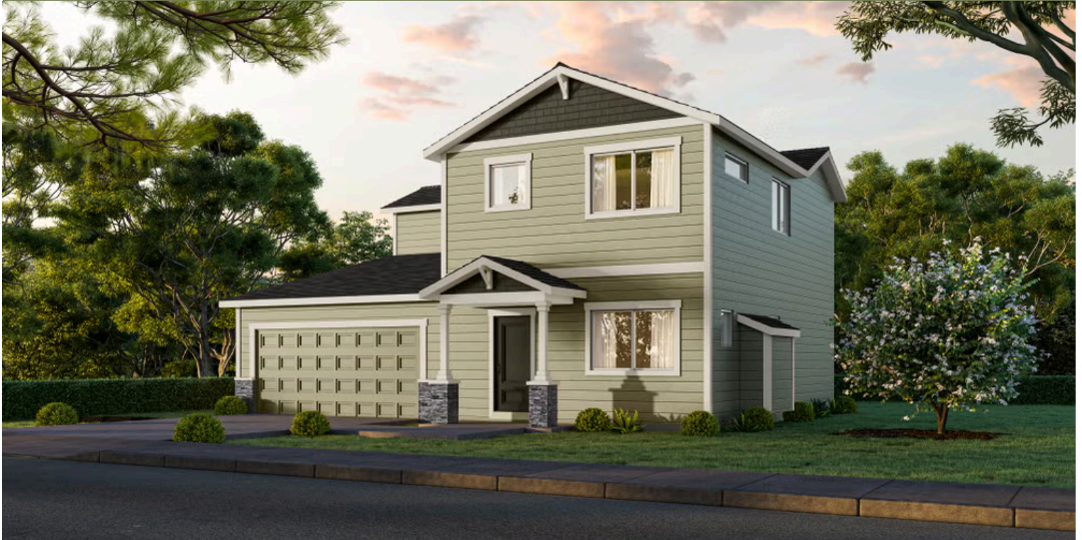
T - TRADITIONAL