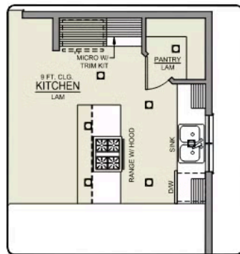
ISLAND HOOD OPTION