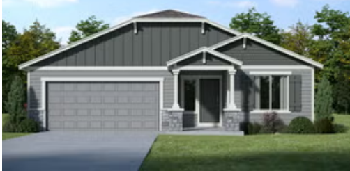
V - Farmhouse, 2 Car