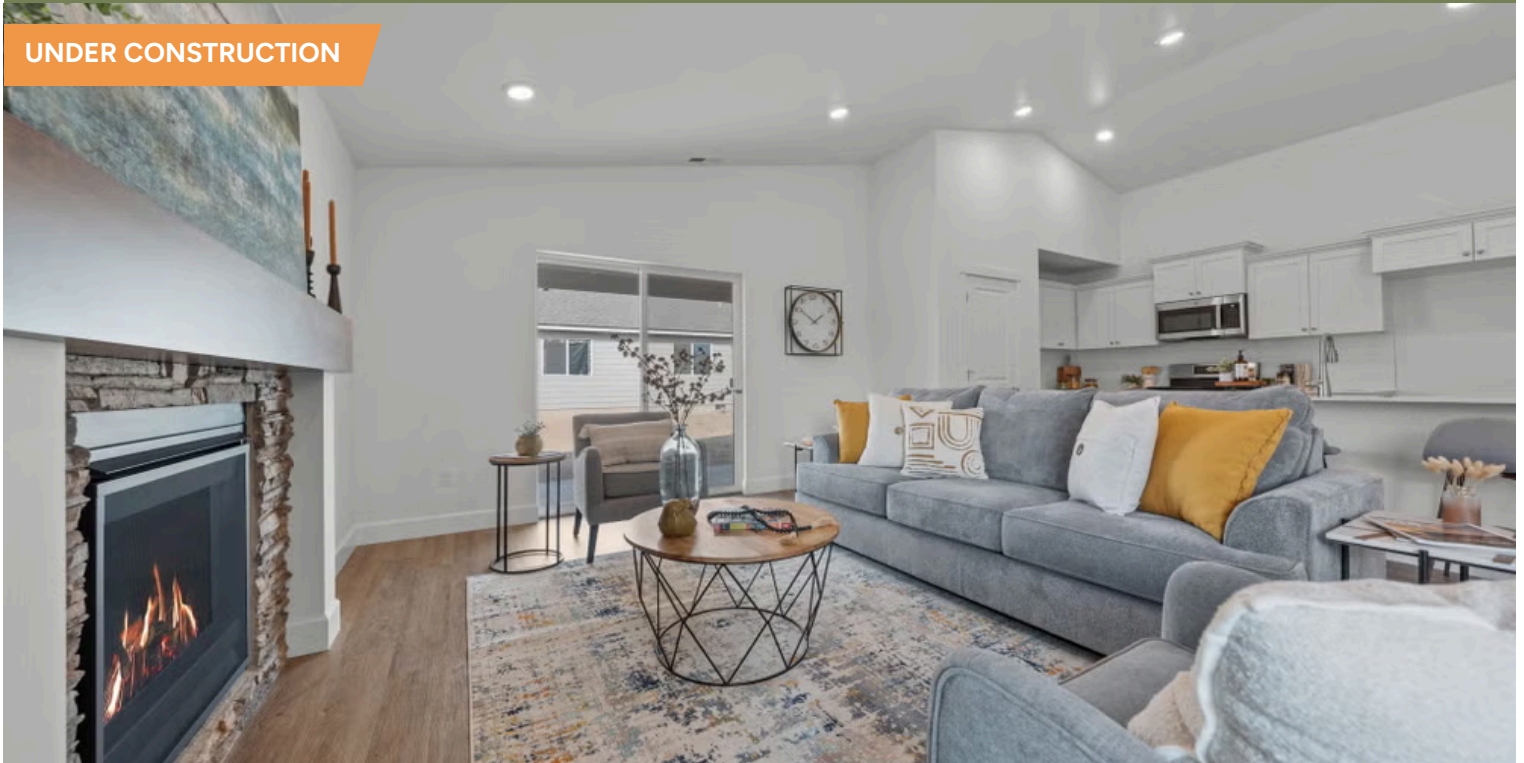
T - TRADITIONAL, 2 CAR