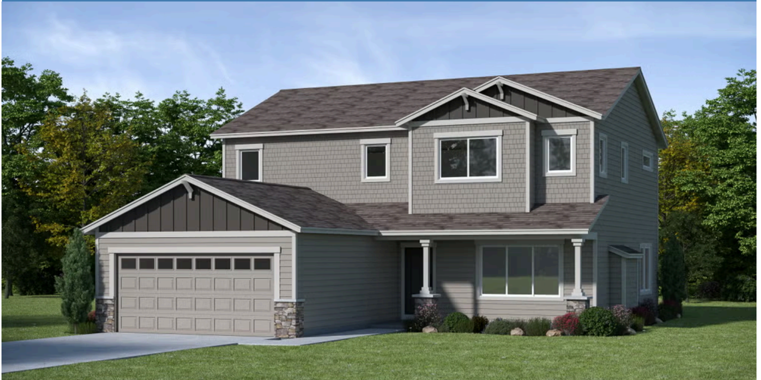
U - Craftsman, 2 Car