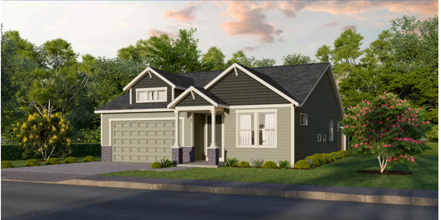
X - Traditional Elevation