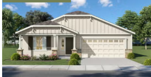
V - FARMHOUSE