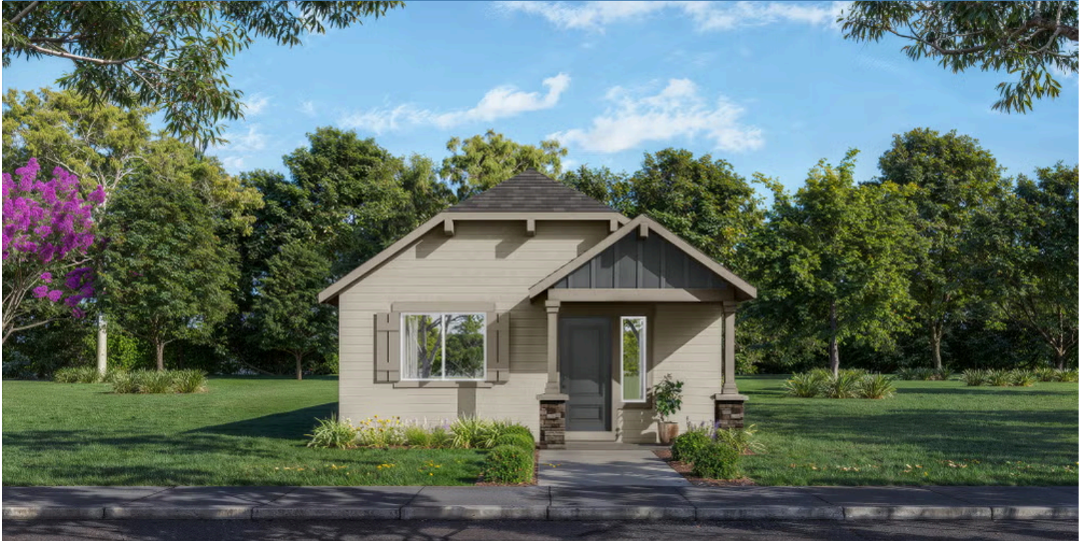
L - Farmhouse