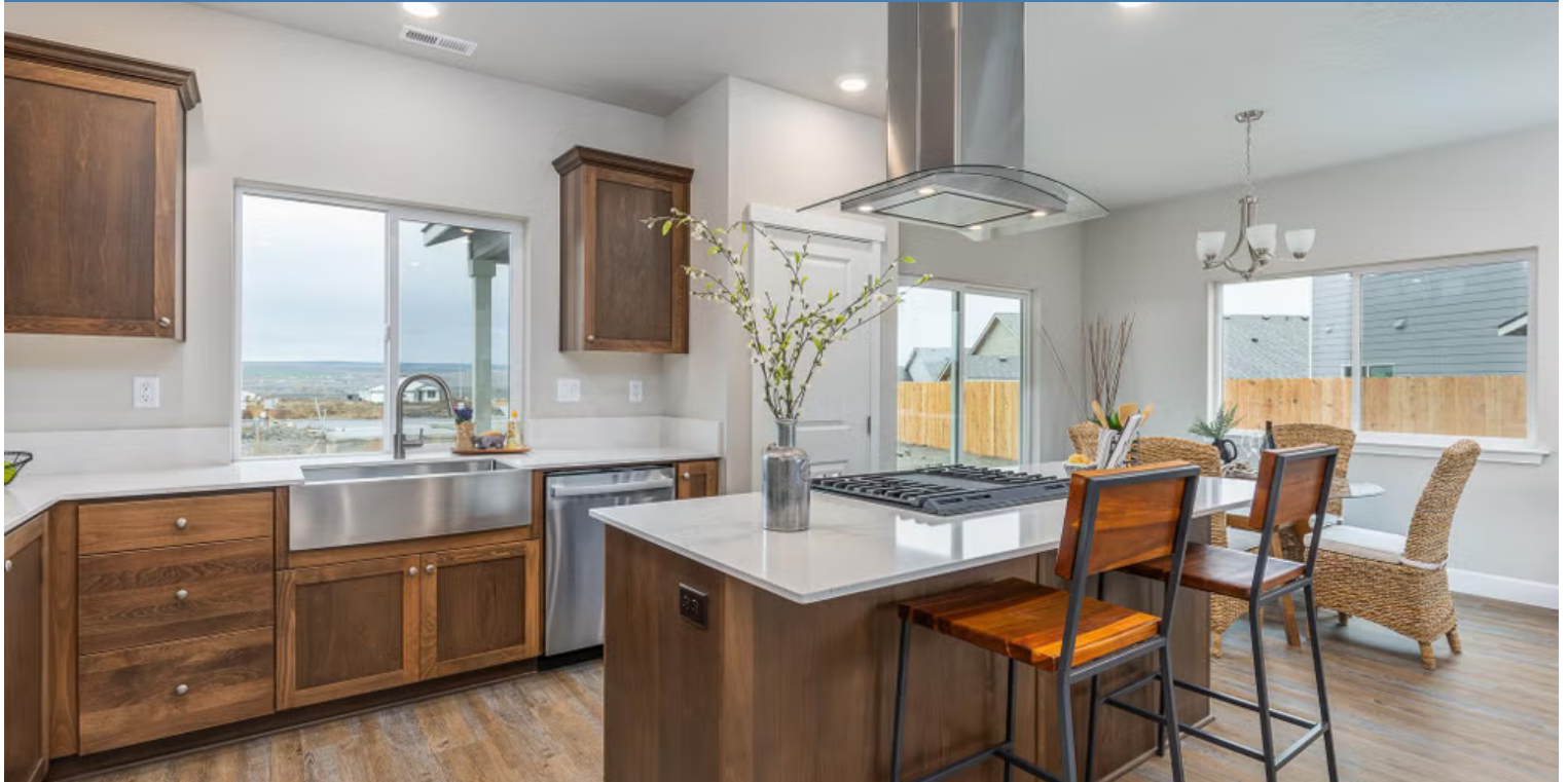
U - Craftsman