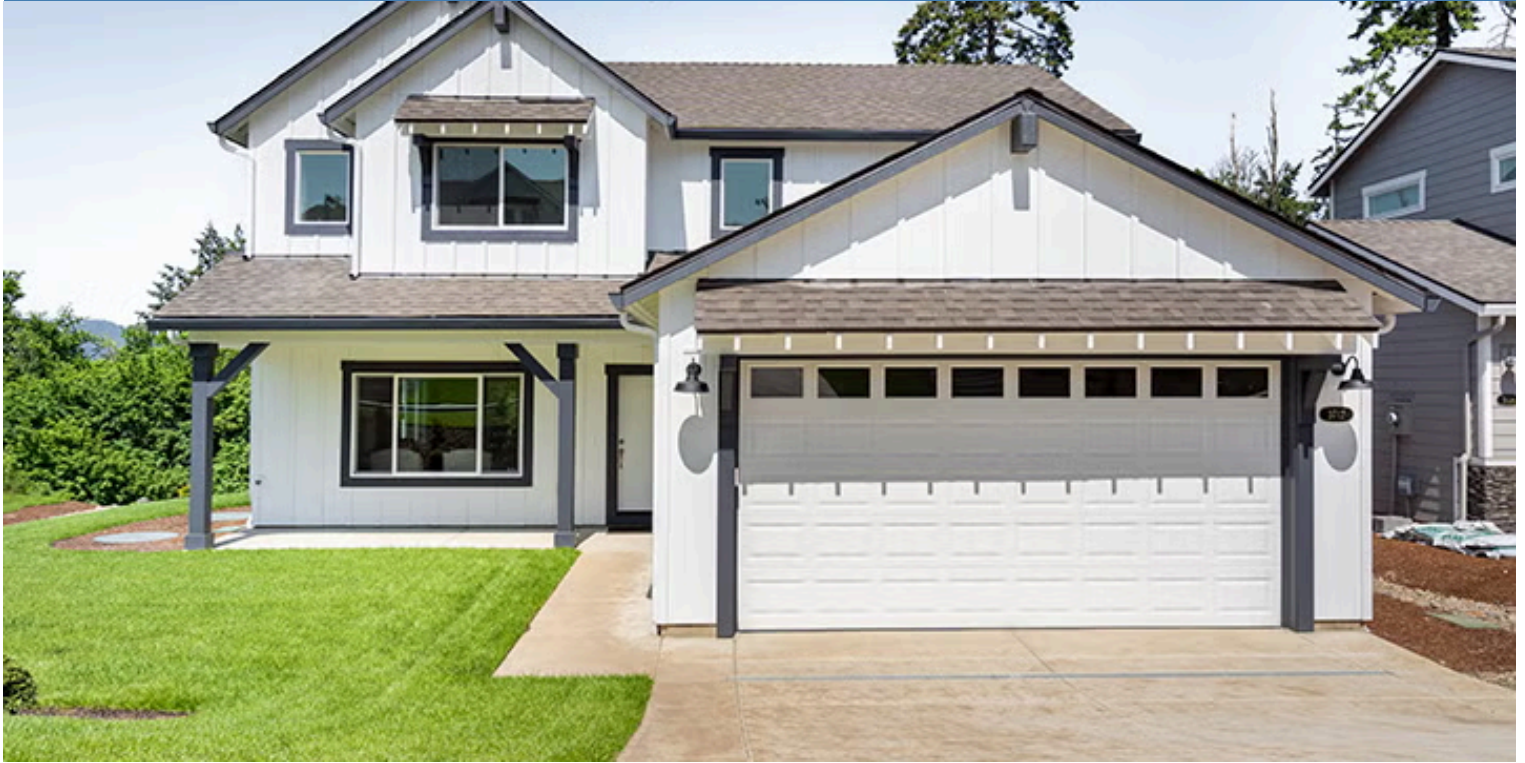
X - Craftsmen