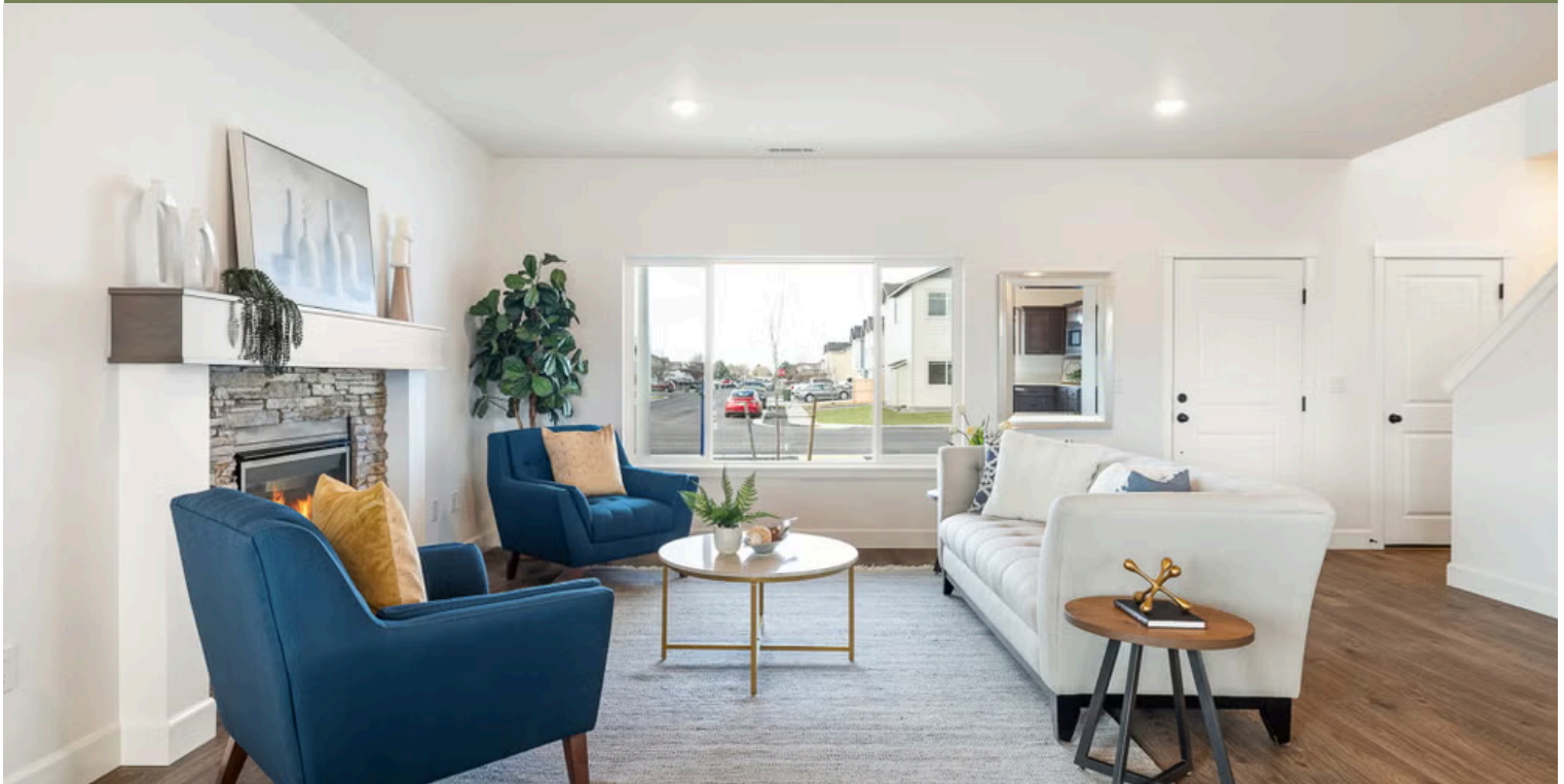
T - TRADITIONAL, 2 CAR