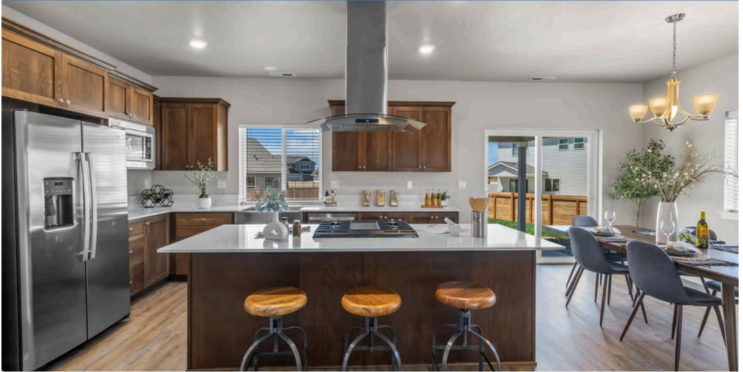
T - Traditional, 2 Car