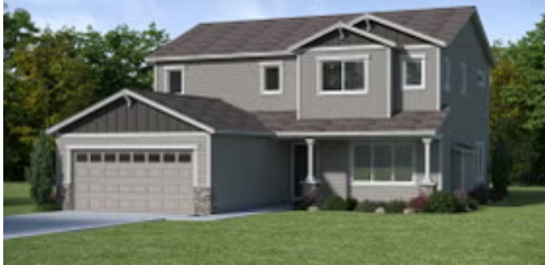
U - Craftsman, 2 Car